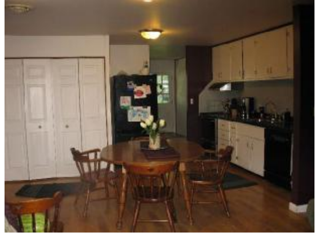
Kitchen & Laundry # K2