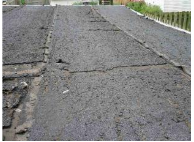
Roof # R2