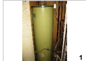
photo of water meter and main water shutoff located in furnace closet. (see photo 2).

20 Keep in mind the advanced age of the water heater. Unit is approaching the end of its expected useful lifespan. Budget for replacement soon. (see photo 1).