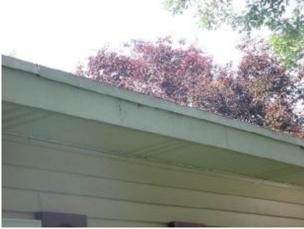
Roof # R1