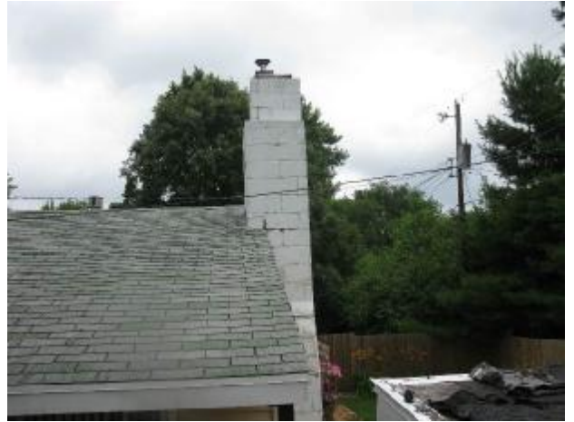
Roof # R4