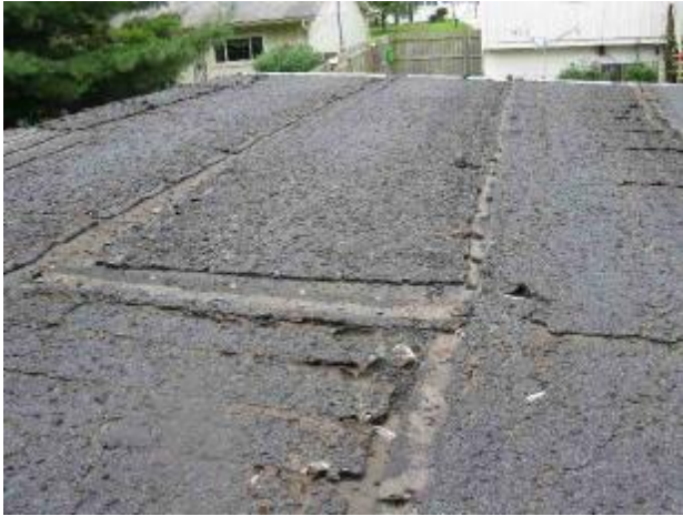
Roof # R3