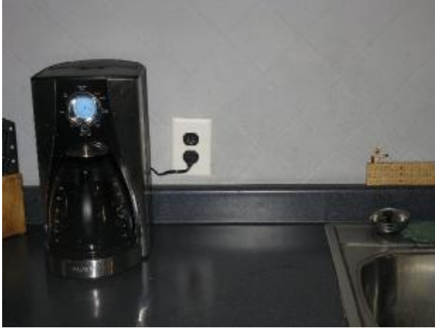
Kitchen & Laundry # K1