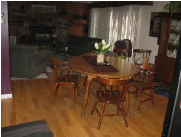
Kitchen & Laundry # K3